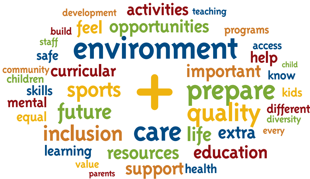
As this word cloud shows, there are many common themes in what the RETSD community values in public education.

See details about the approved 2022–23 budget on page 2.